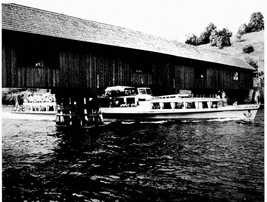
Covered wooden bridge going over the river Rhine