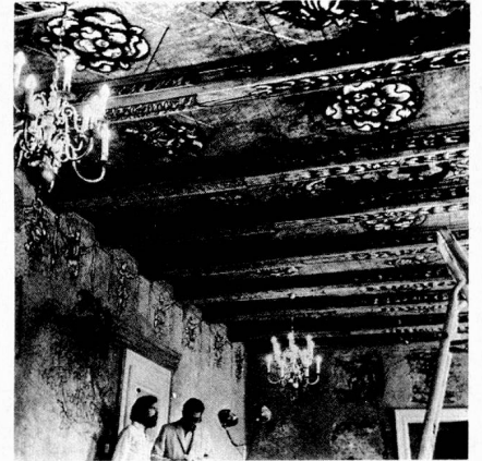
... and after exploratory excavations

federal authorities. Moreover, the public must be granted a specified measure of access to the monument. At present approximately 2000 buildings are under federal protection.