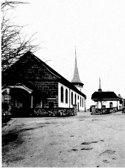
In Tavel (FR), the basically Gothic parish church and the ossuary have been restored