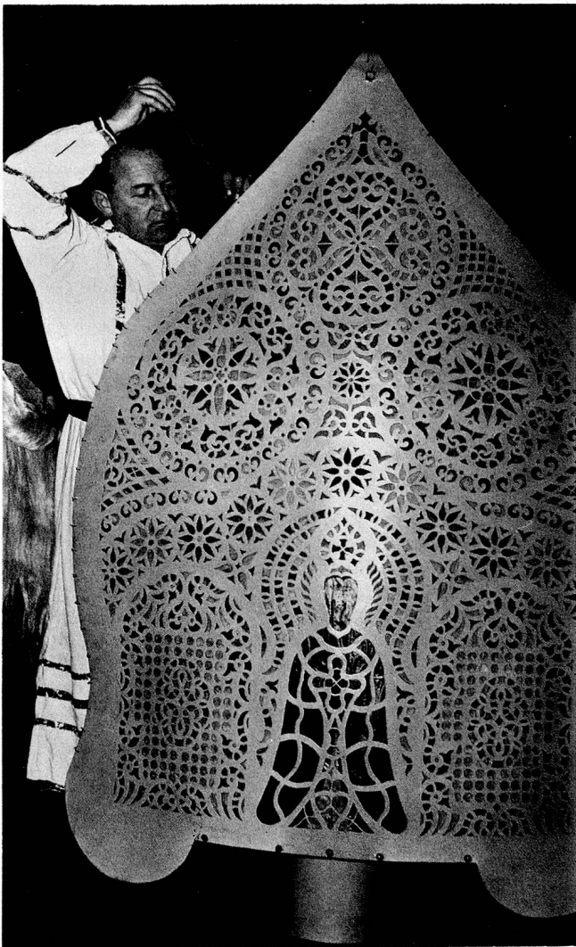
Shortly after 8 p.m. on 5th December comes the great moment — the candles are lit.