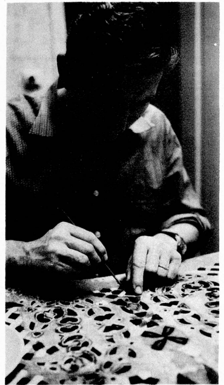
The punched out ornaments are carefully backed with coloured paper.

Luckily, this custom is not destined to disappear. The Nicholas Society fathers, school teachers, all teach the children at an early age how to make at least a small and light copy of an "Yffel". With the pride of grown-ups even the youngest among them carry their mitre around during an afternoon procession on the same day.