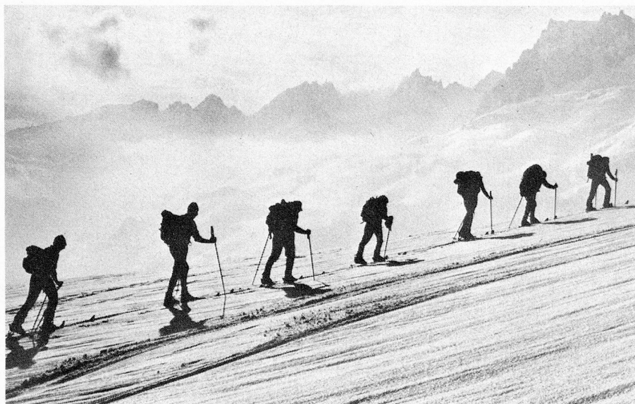
The group follows an experienced leader, usually a mountain guide.