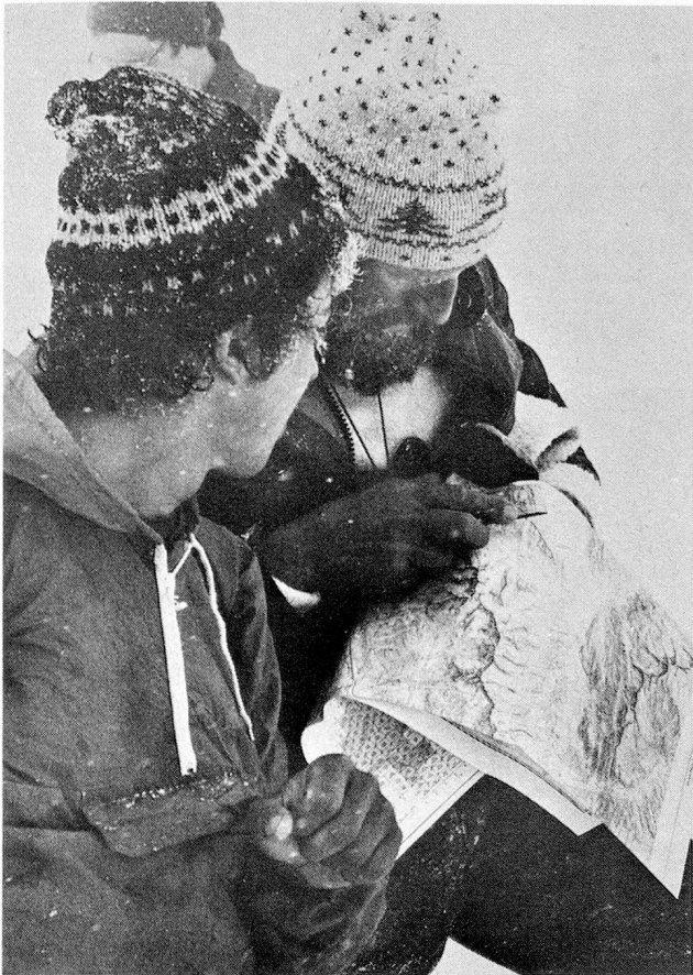
Bad weather and fog may literally appear "out of the blue". A good compass and maps are indispensable items in everybody's equipment.