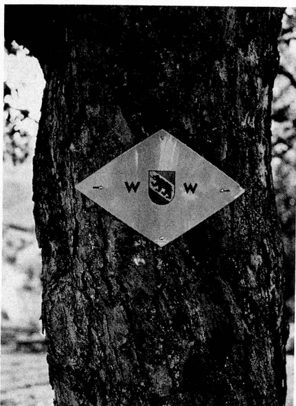
A typical sign on one of our many hiking trails. The author admits having welcomed some of these on his expedition!

The wooden chalets, shuttered and long-eaved as precaution against winter snow, were just as practical in summer. They looked cool and dark inside. The bars were particularly inviting, though at this stage I was still energetic enough to buy lemonade from village stores and to drink on the move. And the meadows behind were perfect.