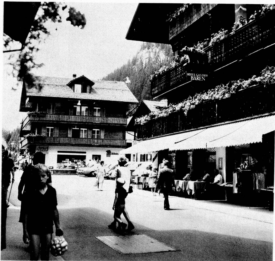
Adelboden, a typical village in the Bernese Oberland, probably never presented a more welcoming respite than that described by our hardy young man.

That night I had not the strength to pitch camp and took a hotel room at 8 p.m. when I reached Adelboden. By then it was snowing thickly. As I stood in reception like a drowned rat, trying numbly to get my gloves off, I was greeted of all people by an effervescent American