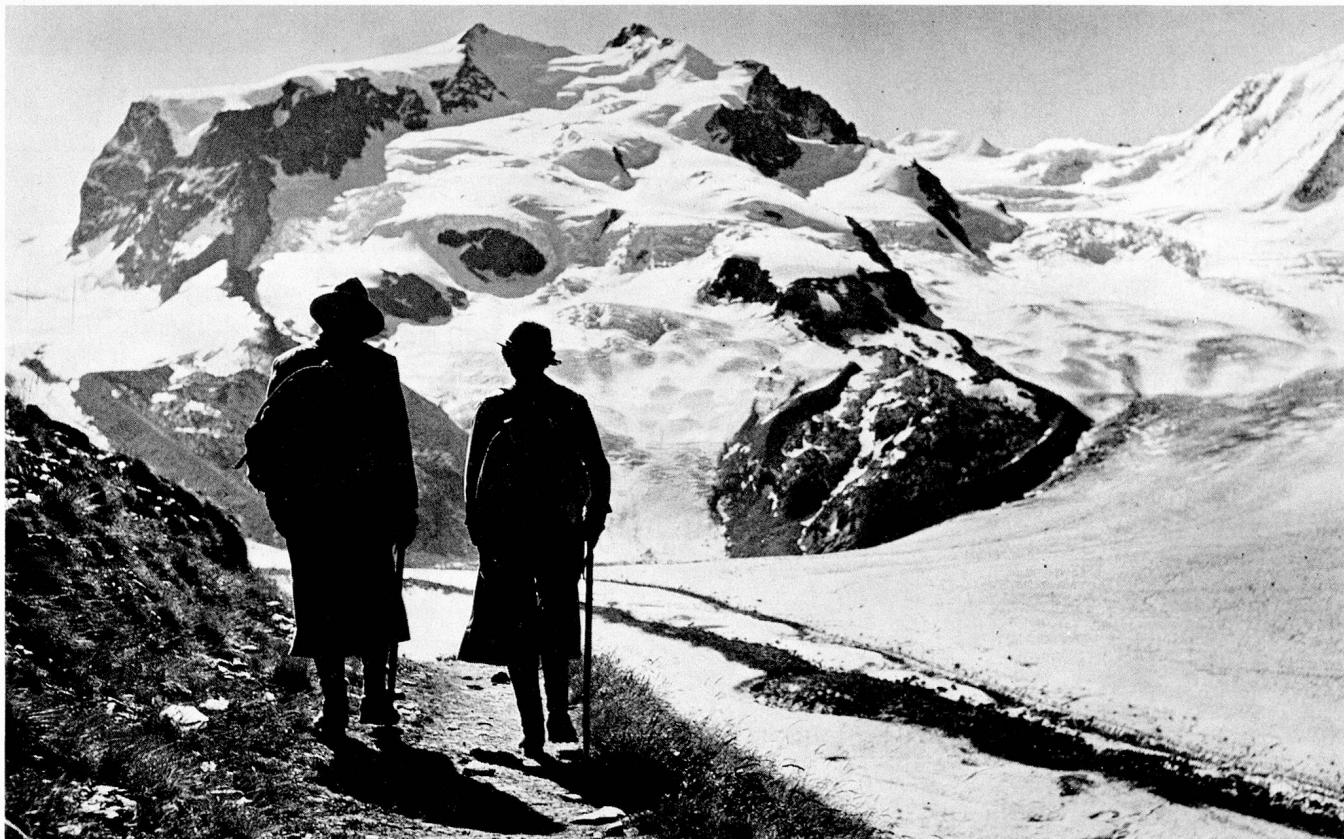
Monte Rosa seen from Zermatt