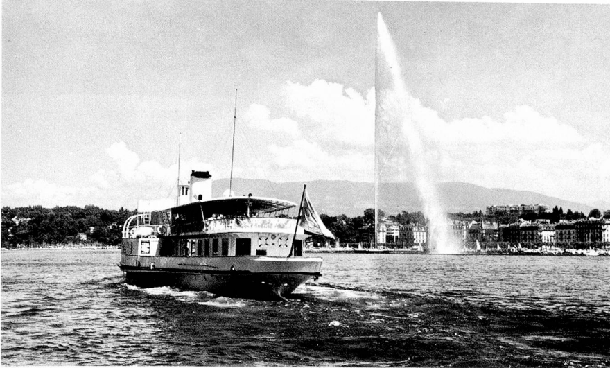
The jet fountain in Geneva, 140 m high