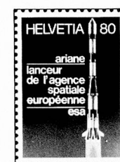
80 c. European Space Agency