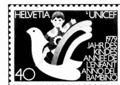
40 c. UN Year of the Child