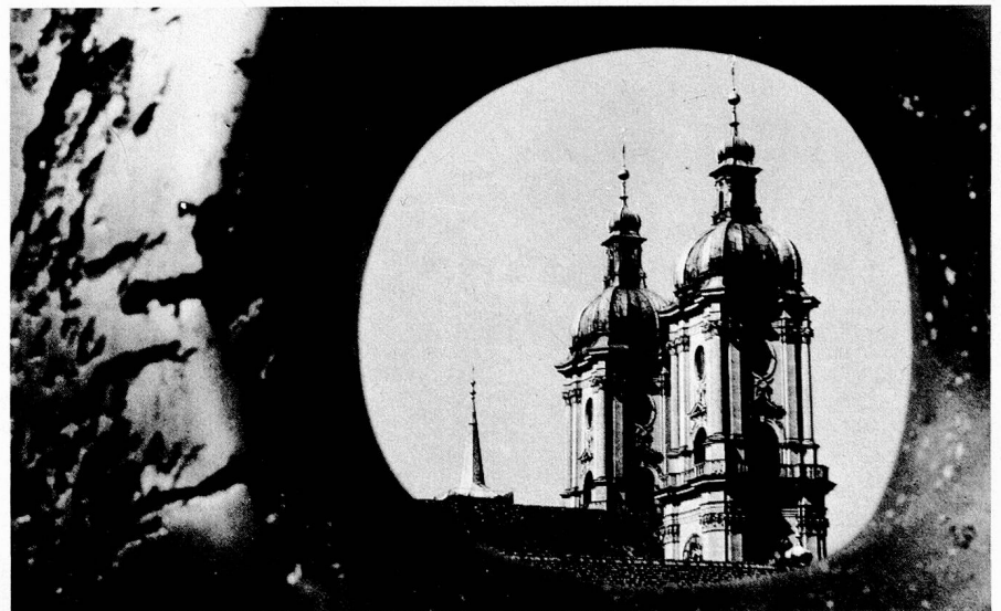
View of St Gall Cathedral

In a similar light the question of jurisdiction must be seen. The applicable law need not necessarily be the one of the place where probate is granted. Many countries may assume jurisdiction over the estate of a Swiss citizen resident there, but apply Swiss law in questions of legal succession and validity of last dispositions (testament, agreement regarding inheritance).