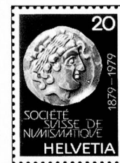
20 c. Centenary of Swiss Numismatic Society