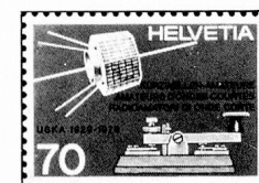
70 c. 50 Years of Swiss Shortwave Amateurs