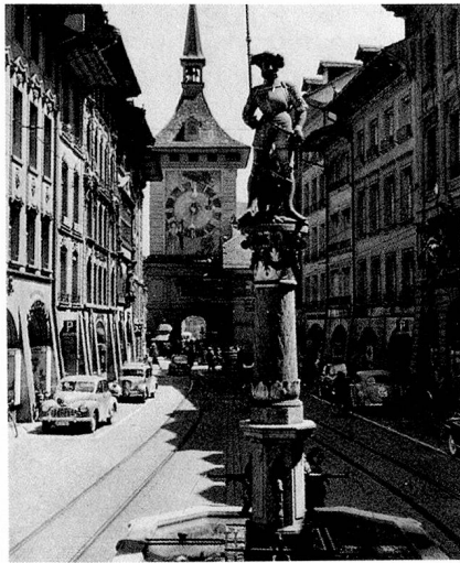
Berne: Markt-gasse with the Marksman's Fountain and the famous Clock Tower

With its 410 Communes divided into 27 administrative districts, the