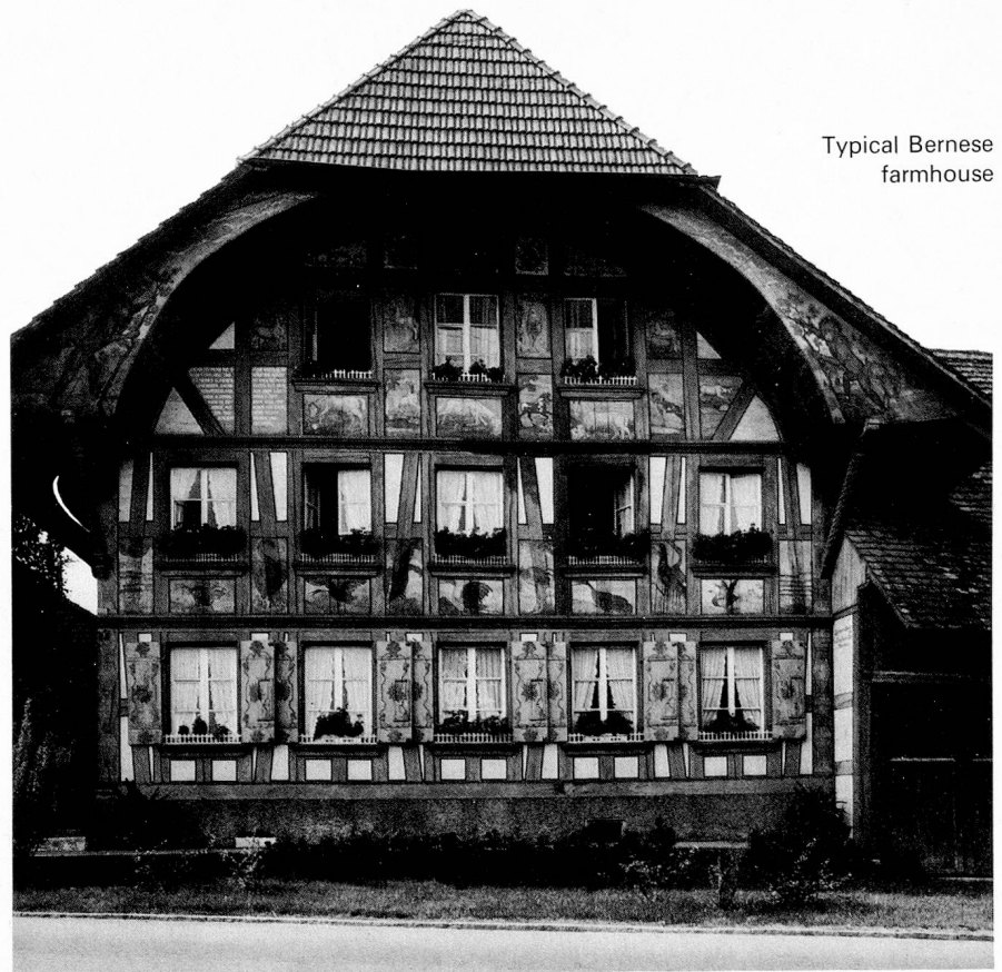
Typical Bernese farmhouse

types of Swiss landscape: the Jura, the Midlands and the Alps. Whilst French is spoken in the Bernese Jura and Bienne is a positively exemplary bilingual town, it is «Bärndütsch» which is prevalent in the rest of the Canton. But anyone who believes that «Bärndütsch» is a uniform language is greatly mistaken. It is one of the attractions of the Bernese language that there are significant differences from valley to valley, from region to region. The Bernese is proud of his local idiom and cultivates it deliberately. The state educational publishers have recently issued a schoolbook with samples of Bernese. But it needs an expert to judge easily whether a person speaks the dialect of Ins, of Trub, of Schwarzenburg or