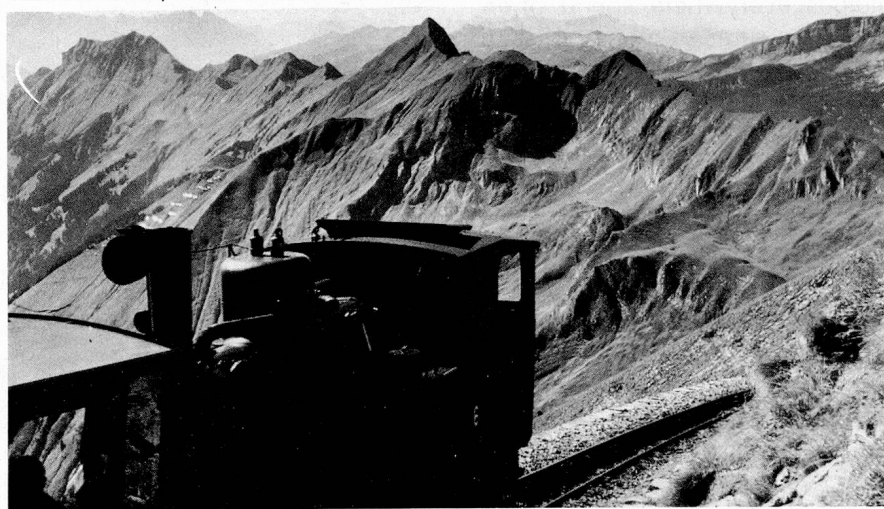
The rack-railway to the Brienz Rothorn, operational since 1892

With a per capita income of a little over Fr. 18 000.- as compared to the Swiss average of approximately Fr. 20 000.-, the Canton of Berne belongs to the economically less favoured Cantons of Switzerland. The process of restructuring in the watch industry has caused considerable problems in the Bernese Jura. The high rate of exchange of the Swiss Franc also causes worries to the tourist industry, for the Canton of Berne (after the Grisons) has available the second-largest number of hotel beds. The future of the Bernese economy need, however, not be judged too pessimistically. Thanks to its central position and the newly constructed network of national motorways, the Canton of Berne is easily accessible. The projected improvement of the Loetschberg line by making it double-track will also contribute towards enhancing the Canton's attraction for business undertakings. Local planning in the Communes, now largely completed, and ecological development concepts for the various regions will create a well-balanced structure which is in keeping with the needs of the economy