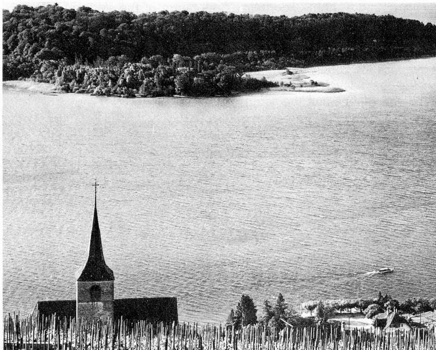
The village of Ligerz with a view of the Isle of St. Peter where Jean-Jacques Rousseau lived in 1765 (Photo SNT0)