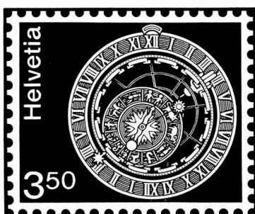
Astronomical clock of Berne clock tower