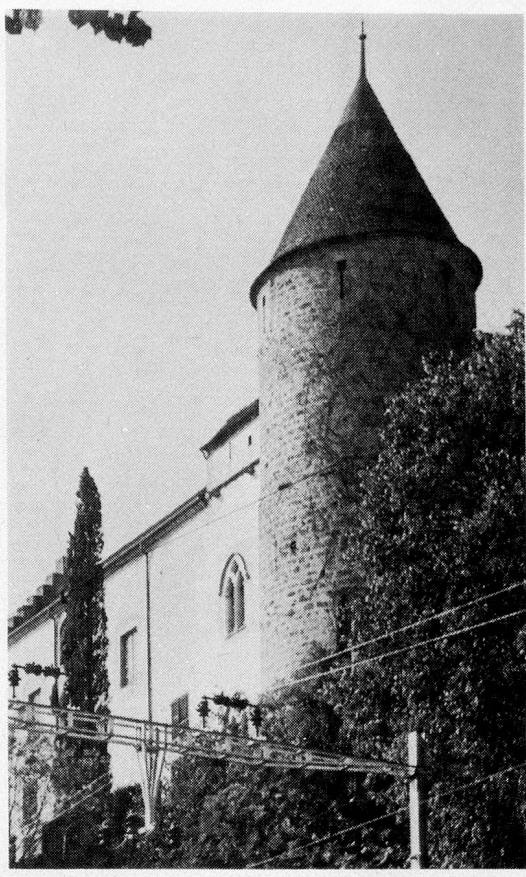
A Vaud castle that faces the 'invaders' — Page 7