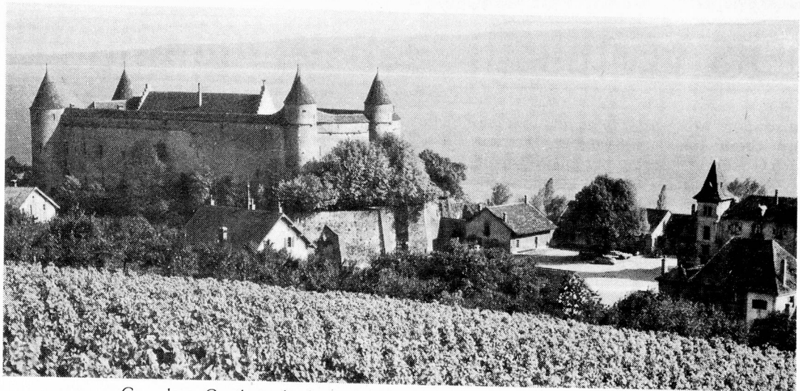
Grandson Castle is the home of the Swiss Institute of Arms and Armour

A MEMBER of the Swiss community in Britain is at the forefront of a most unusual battle.