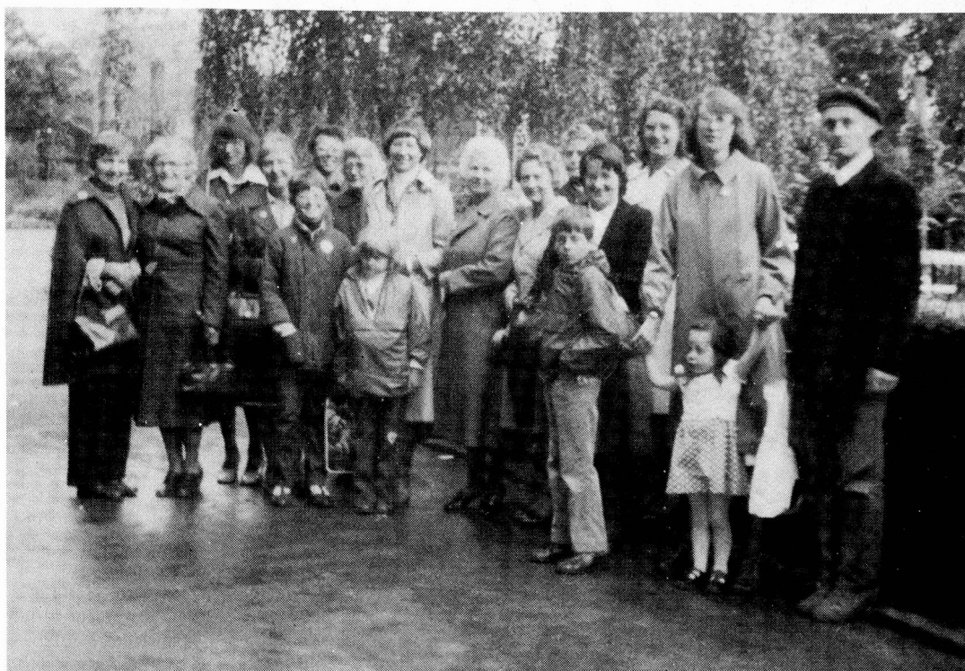
Damp but not dispirited at Bristol Zoo

costumes of Evolène in the Val d'Hérens sang with grace and charm and most efficiently and were enthusiastically applauded by the large audience.