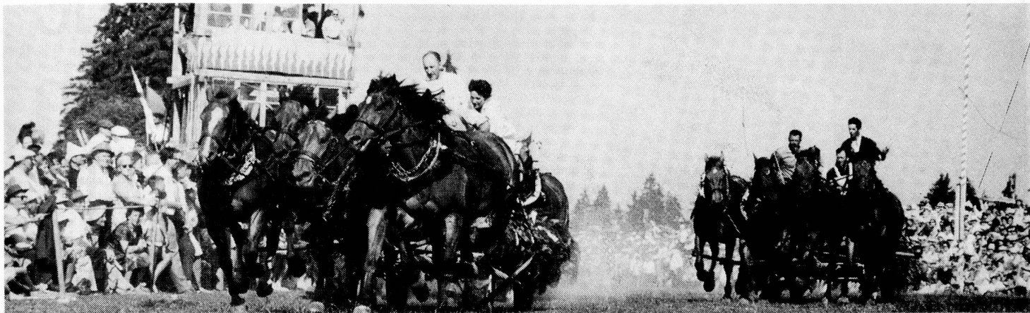
Horse racing at Saignelégier in the Jura mountains

Compiled by the Swiss National Tourist Office