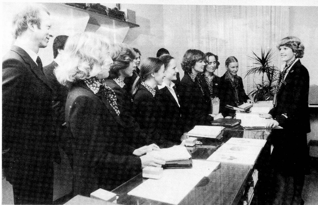
A maître de cabine briefs her crew