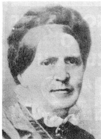
Johanna Spyri, author of Heidi , one of the most popular children's books ever written.

The 26 part series, shot on location in the Engadine resort