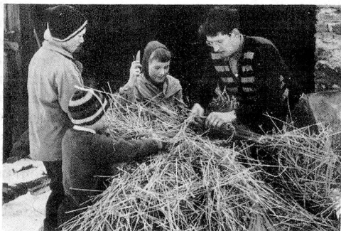
Gathering straw from the farms

The "hom strom" is then burnt to the accompaniment of folk songs, followed attentively by guests from far and near as night falls. And with that the winter is banished - at any rate symbolically - though winter sports can still be enjoyed in the mountains of Switzerland for weeks to come, even if the full rigours gradually begin to relax.