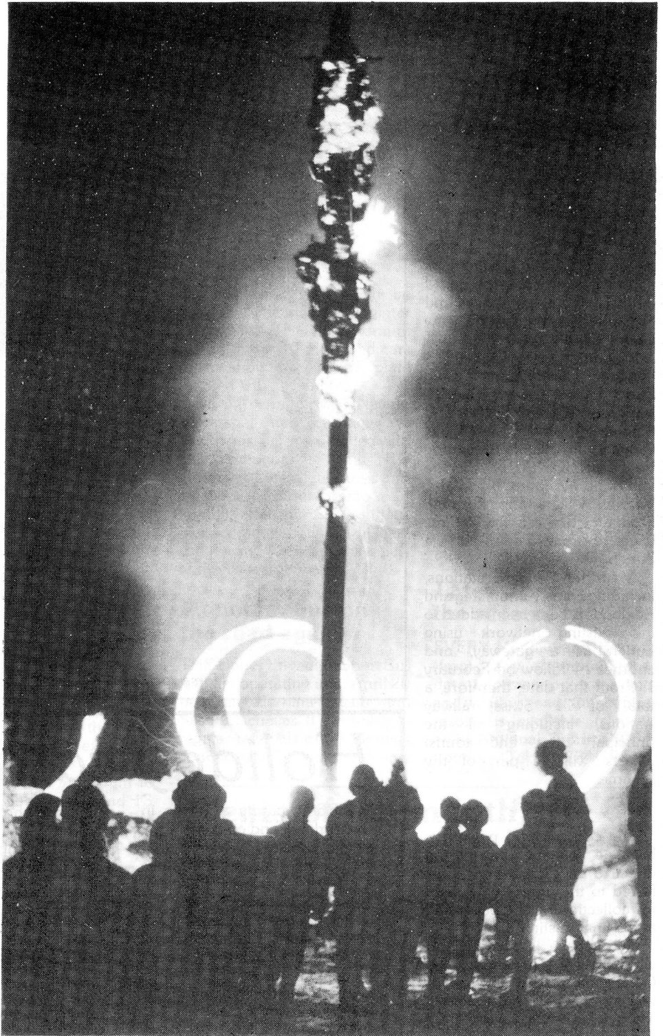
With the whole village participating, the "hom strom" or straw man is burned