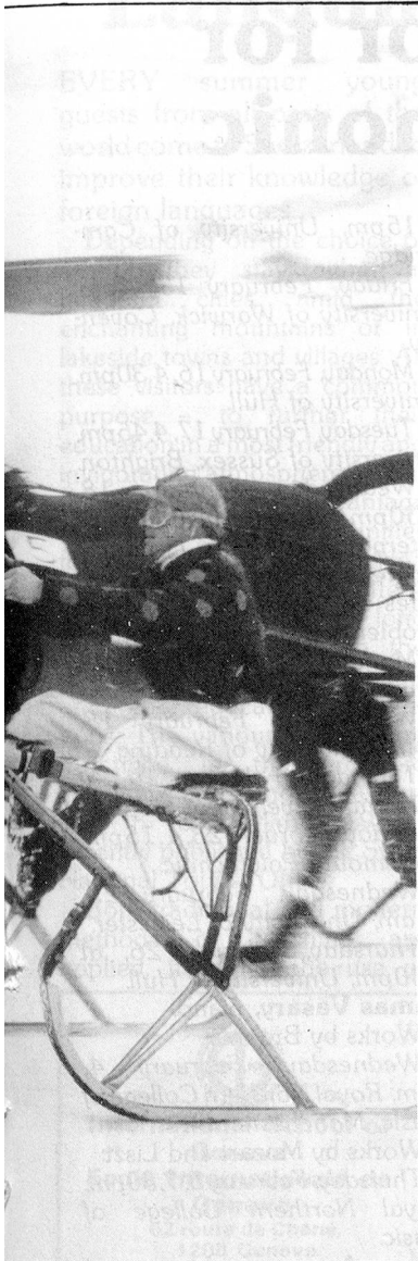
lar weekend attraction in February

THE Swiss National Tourist Office has again published the useful booklet "Events in Switzerland Winter 1980/81 and later" which is available free of charge.