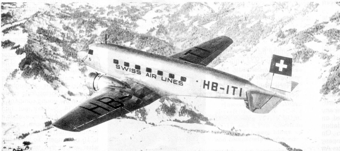
The Douglas DC-2 which inaugurated the service between Switzerland and London in 1935. It only carried 14 passengers, yet 6,325 flew the route in its first year.

In conclusion I should like to thank all our friends in the Swiss community in our region for their loyal support. Without it we would not now face the future with the same degree of confidence.