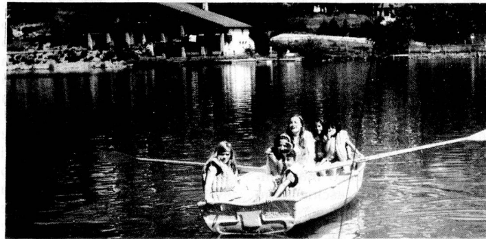
Swiss schools provide an opportunity for tourism

There are also other more intimate reasons why certain