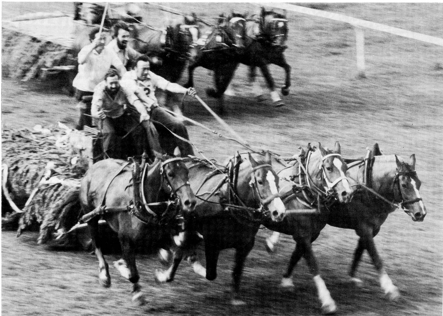
Four-in-line . . . the impressive spectacle of the quadriga race