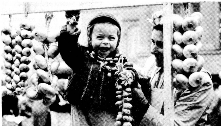
A young boy gets the feel of a stall at the Onion Market