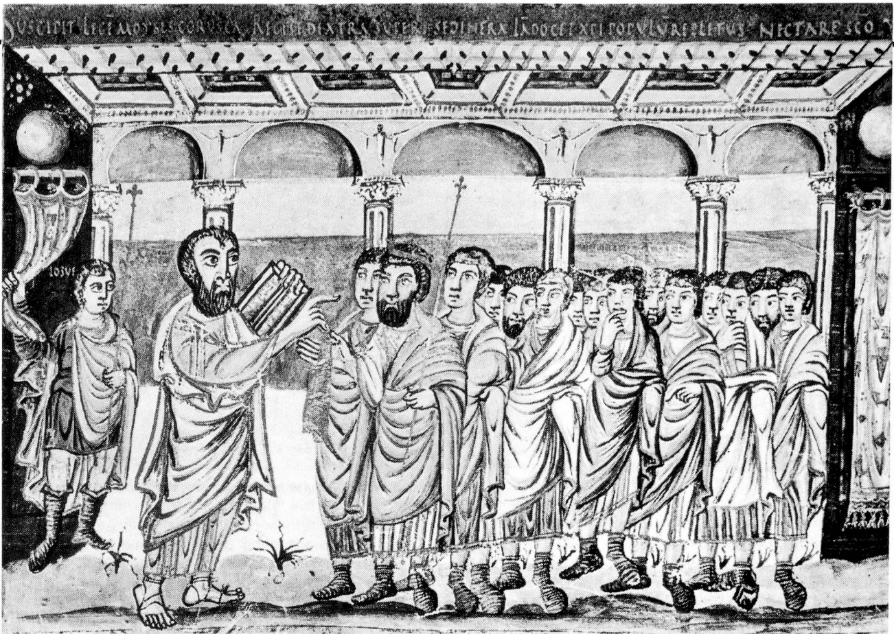
The Israelites receive the Ten Commandments from Moses – another illustration from the Moutier-Grandval Bible

books by some children in London in the early 19th century.