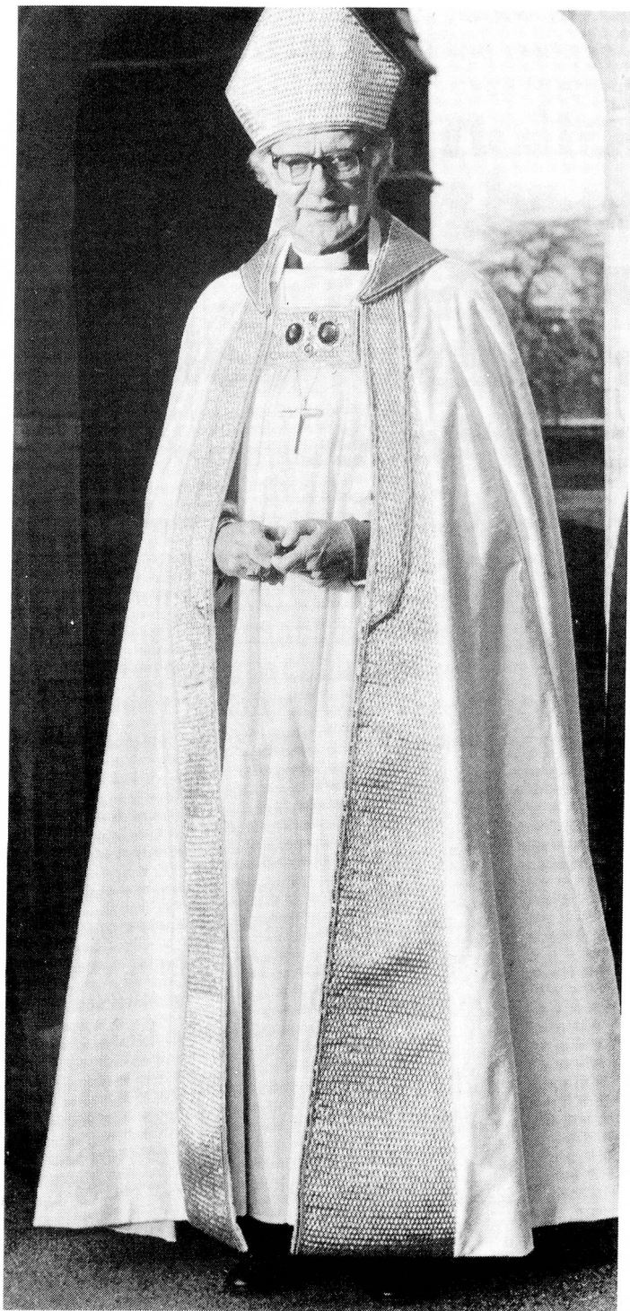
Swiss visit for Archbishop Runcie:

He will open the festival with a piano recital on Sunday, August 8 and will also be involved in lectures and master classes. He will concentrate during the festival on the late works of Liszt.