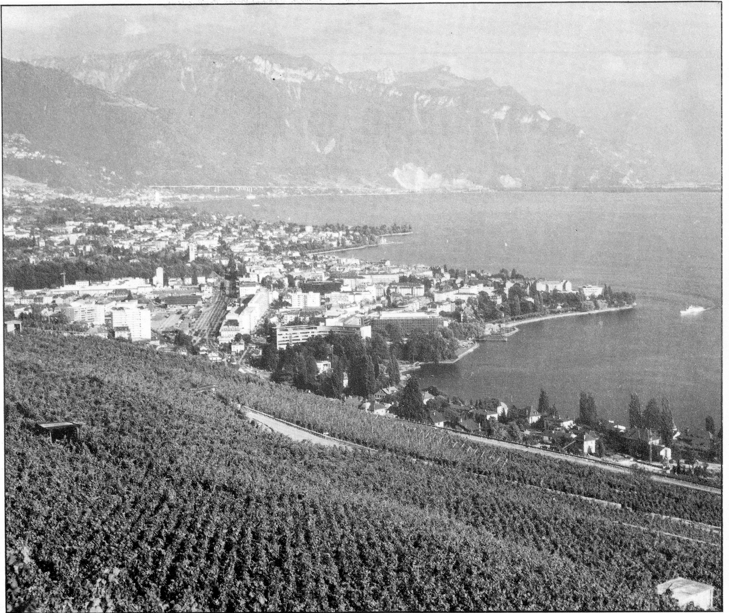
Vevey and Montreux lie between two wine growing areas in a region which was producing wine 1,000 years ago.