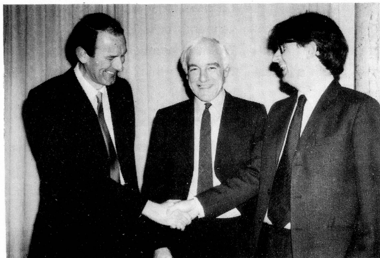
British scientists John Vine, Drummond Matthews and Dan McKenzie have received a joint £70,000 award in Switzerland (see this page).