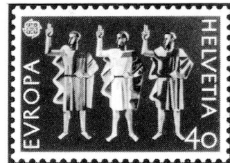
Echoes of 1291: this year's "Europa" stamps