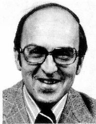
Economics Minister Kurt Furgler, 58 (Christian Democrat)