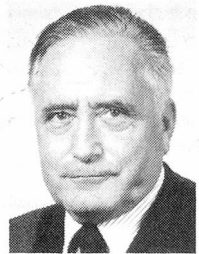
Defence Minister Georges-André Chevallaz, 67 (Radical)