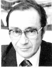
Foreign Minister Pierre Aubert, 55 (Social Democrat)