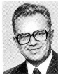
Transport and Energy Minister Leon Schlumpf, 58 (Peoples' Party)