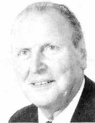
Finance Minister Willi Ritschard, 64 (Social Democrat)