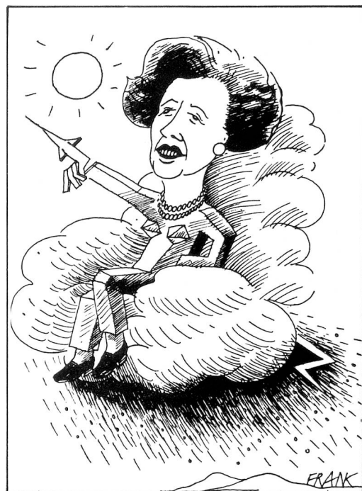
Margaret Thatcher, the victorious "Iron Lady"