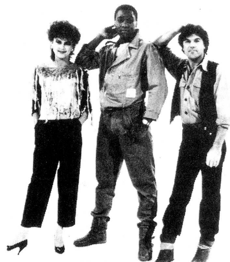
The BBC took two awards with its " Three of a Kind " comedy show

"Another is to provide the assembled delegates with complete texts, which distracts from what's happening on the screen. The third and most effective side is subtitles".