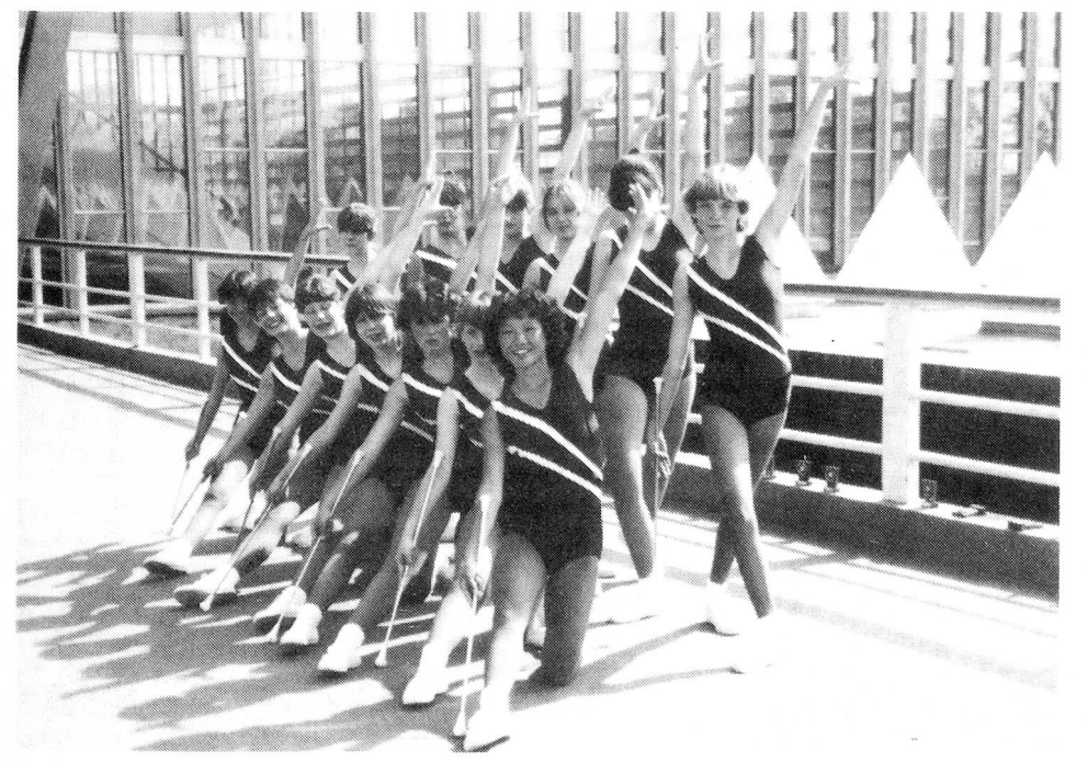
Another Swiss team, the Majorettes of Bienne, took part in the group section of the competition