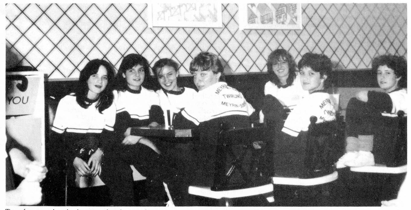
Time for a meal and relaxation after the marching

"They were so charming", he said, "and even when it was only a rehearsal they carried the Swiss national flag with such pride. Their bearing, their neatness and physical fitness were