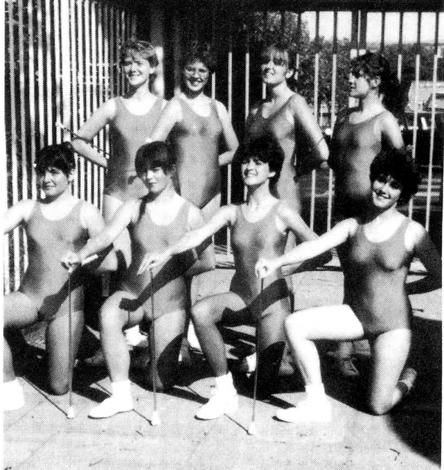
The Meyribelles at Crystal Palace

The girls remained cheerful though. As the coach carried the two teams back to Kent, the Meyribelles were still singing.