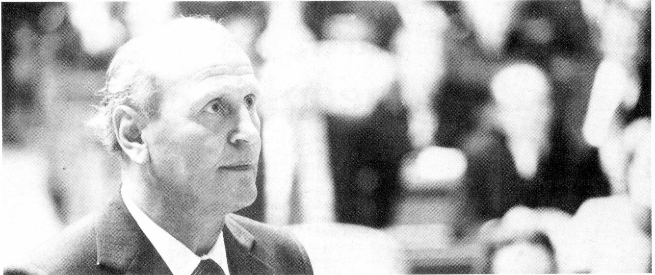
The late Willi Ritschard