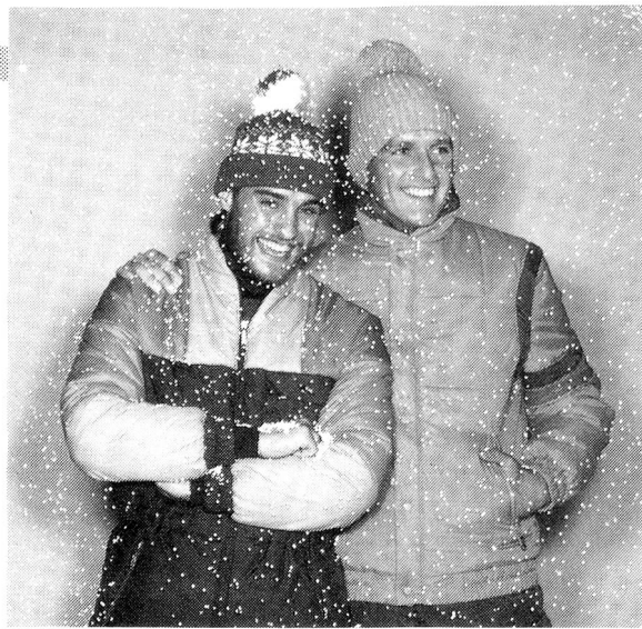
Two outfits for the man in your life. The one-piece has deep pockets and elasticated waist and cuffs; while the quilted jacket has zip out sleeves, and colour co-ordinates with the salopettes.

Here in the guest house I can often welcome the Swiss from home (Switzerland) and since my father came to live with me, recently a widower at 84, we have visitors very often, both as private and official guests. Our young Swiss mother has managed (though having an English husband) to teach her children Swiss German. So we feel we are creating our Swiss colony abroad!