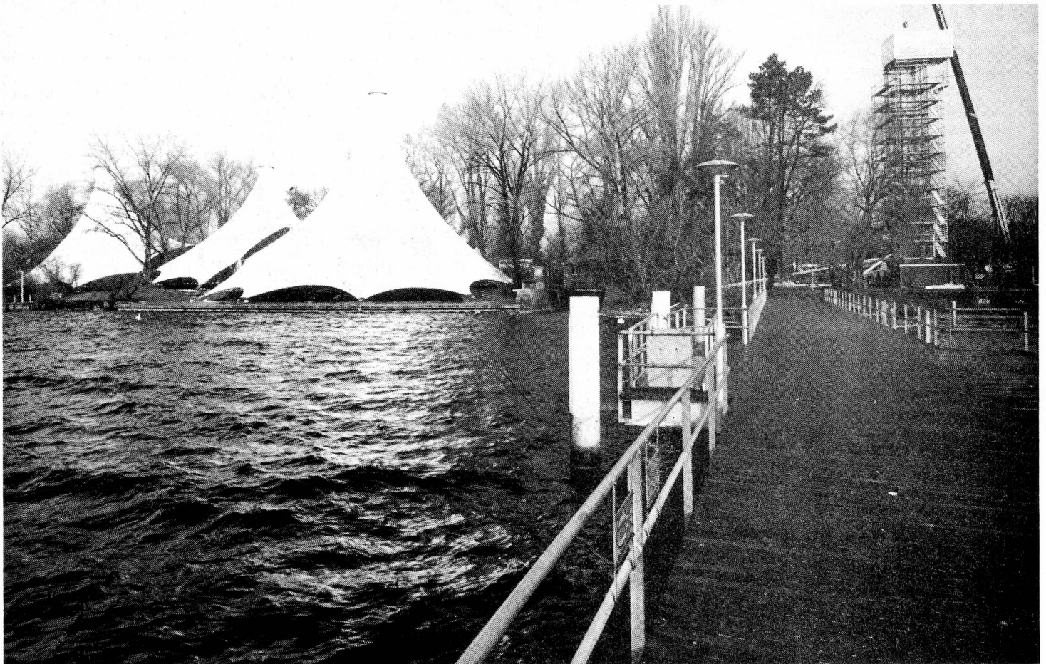
Looking across the lake towards the pavilions which will house the Phaenomena

A water dome, an echodrome and an enclosure for balancing exercises are also planned.