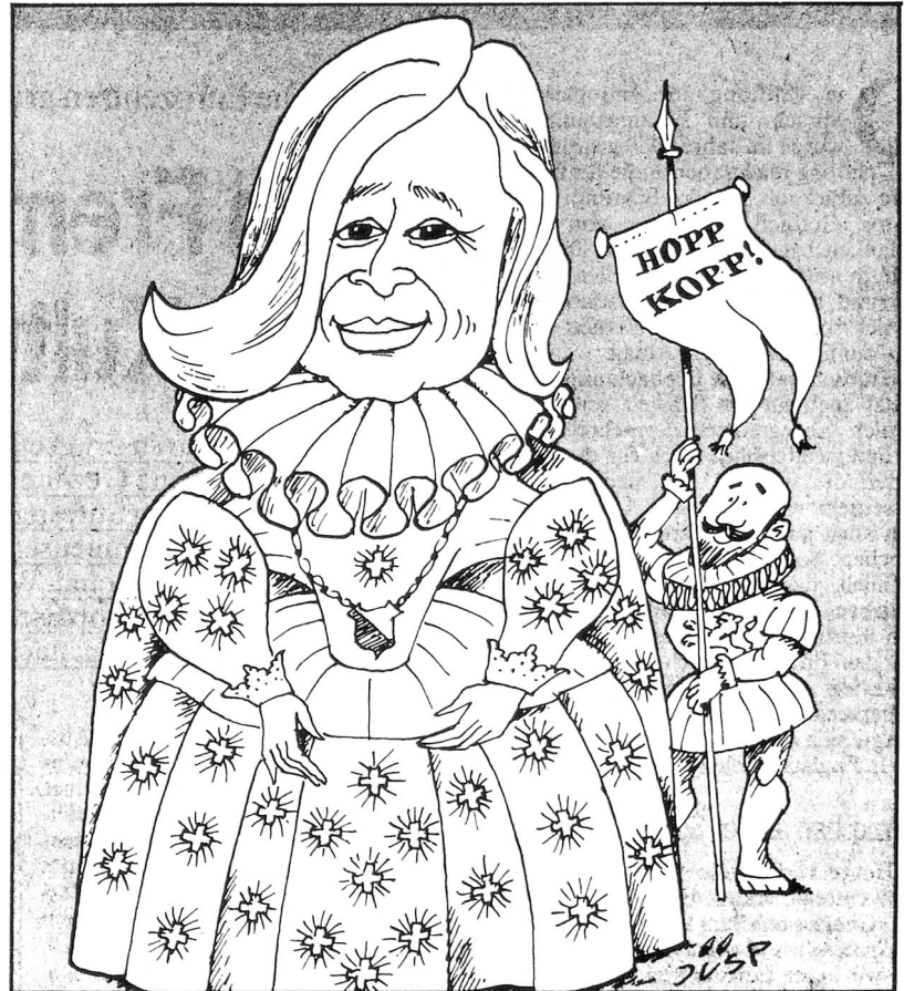
Switzerland's Queen Elisabeth

But he and his wife rejected allegations against him as groundless – and Mrs Kopp said she believed the attacks may even have swung sympathy votes in her favour.