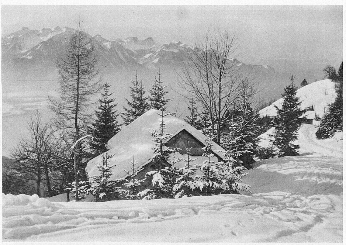
An den Schneehängen von Caux. Sur les pentes neigeuses de Caux / On the snow slopes of Caux / Sui nevosi declivi di Caux