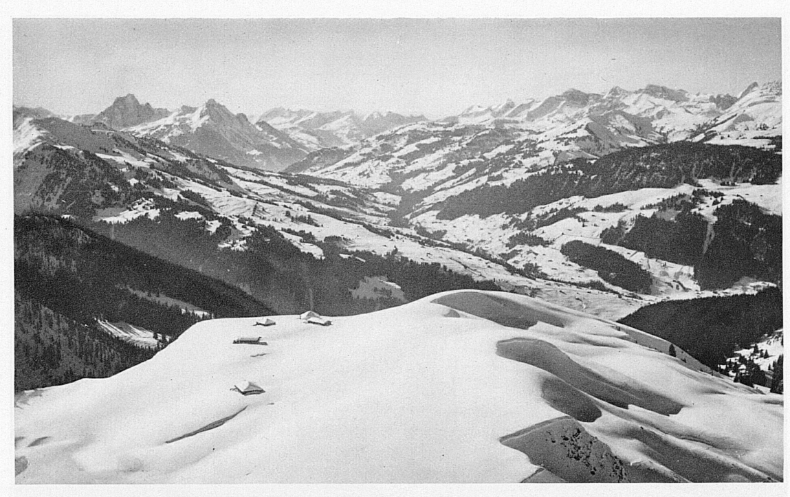
Das Schneereich der Montreux-Oberland-Bahn | La magnifique contrée de sports sur le parcours du Montreux-Oberland The snow réalm of the Montreux-Oberland Railway Magnifico panorama invernale nella regione della ferrovia Montreux-Oberland