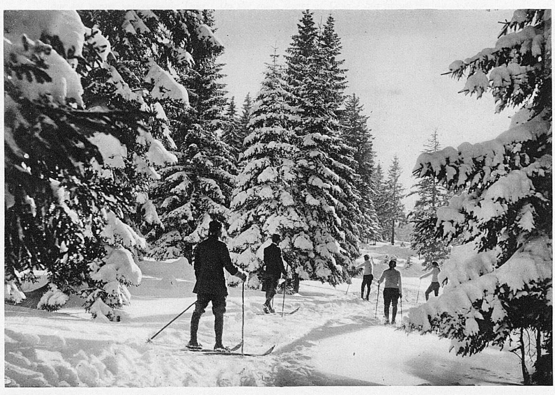
In den märchenhaften Wäldern des Jura | Dans les féériques forêts du Jura In the Fairy Woods of the Jura | Nelle foreste del Giura