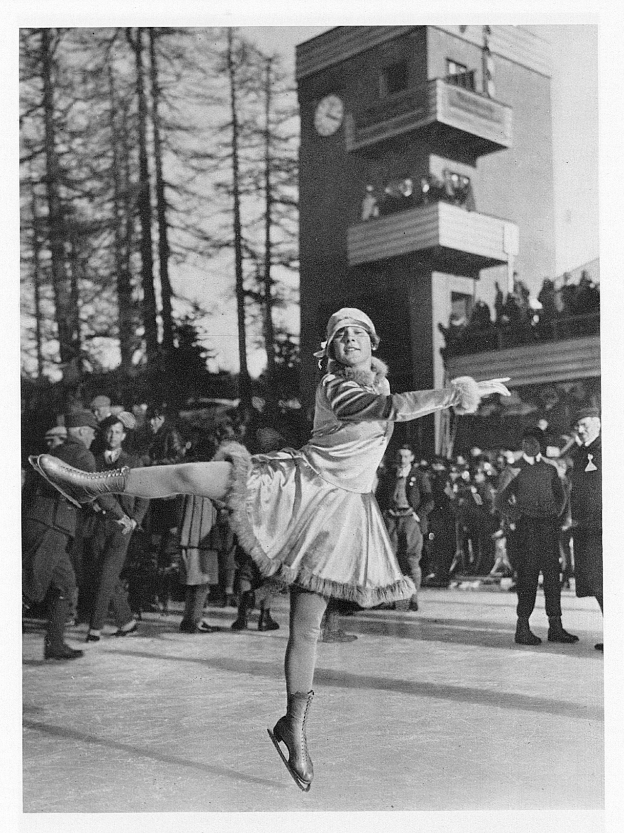
Die Olympiadesiegerin Sonja Henie in St. Moritz / Sonja Henie, lauréate du patin aux Jeux olympiques de St-Moritz The Olympian Lady Champion at St-Moritz / La vincitrice dei giochi olimpiaci di St. Moritz, Sonja Henie