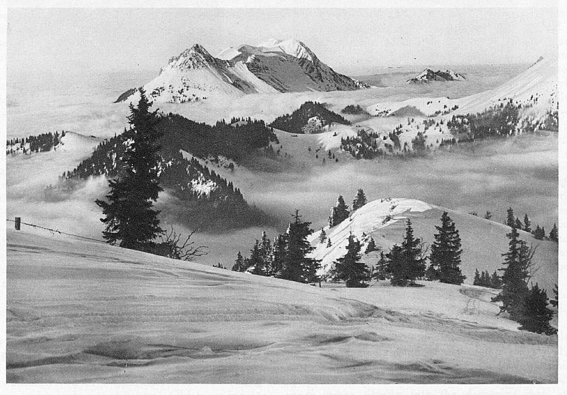
Im Sportgebiet des Moléson Le Moléson et sa région des sports / In the sport district of the Moleson / Nella regione sportiva del Moléson