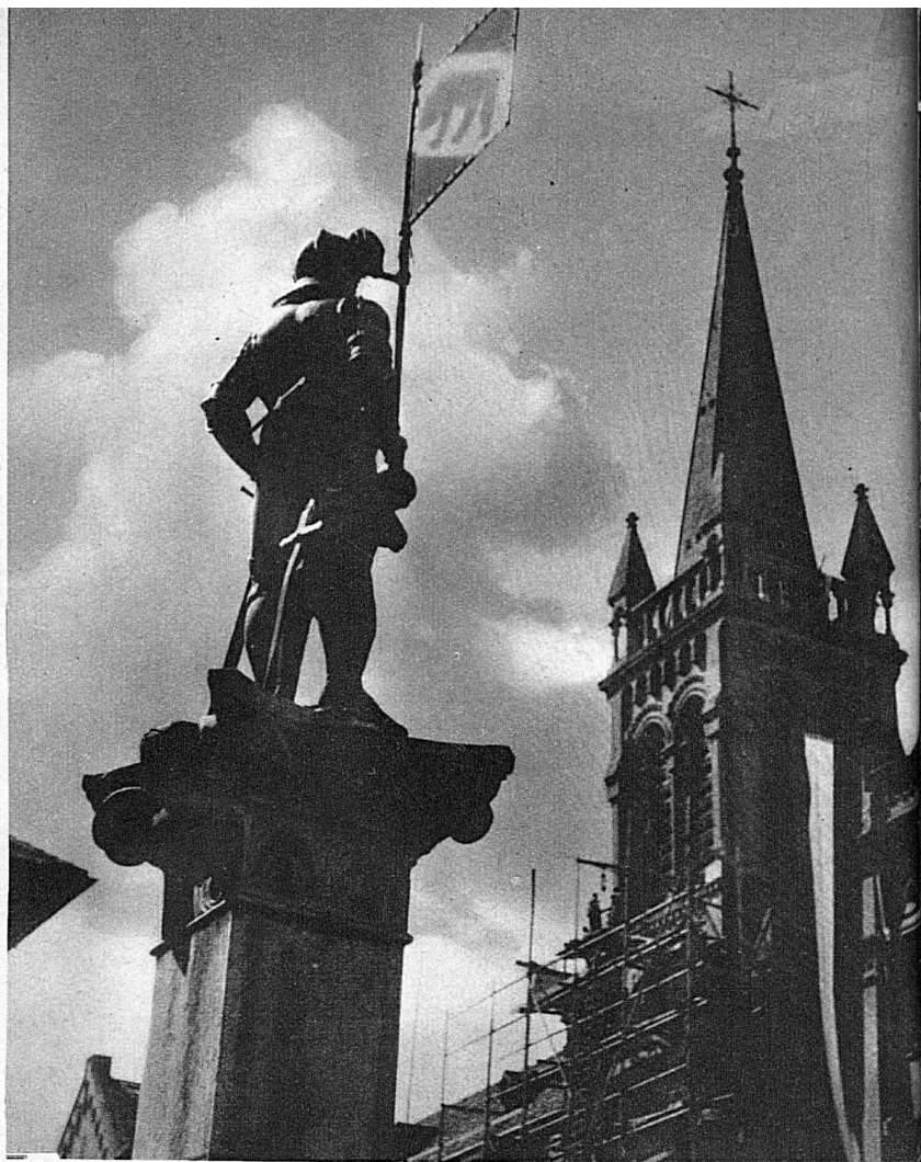
A typical old corner of Berne

It is due to the contour of the river that the distant view of the mountains may be had from all parts of the town; but if the weather is favorable it is worth while taking the funicular up a thousand feet to the top of the Gurten. From thence the view extends on all sides. Beneath you rests the town, now spreading on both sides the river, and encircled with forests and cultivated hills. To the North is the long line of the Jura which parts Switzerland from France, and to the South is the view we have come to see! Forty miles off they are, those giants of the Oberland, the Jungfrau, the Blumlis Alp, the Wetterhorn and a host of