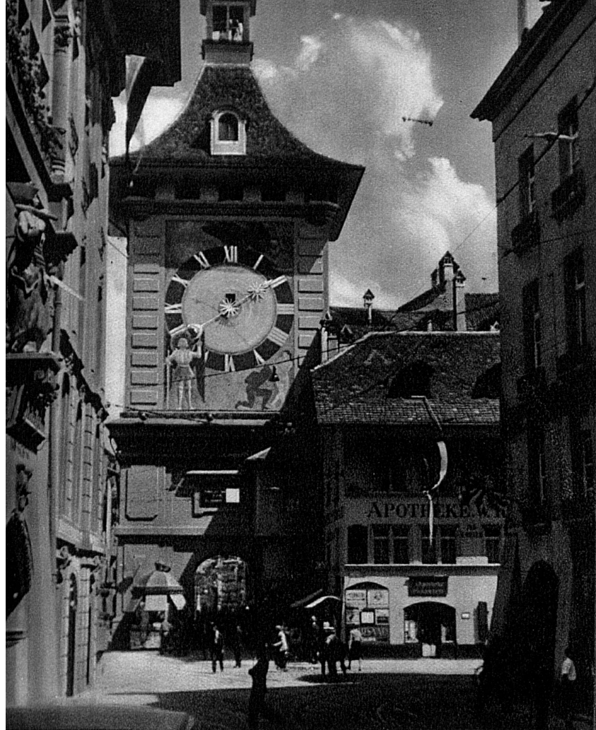
The Clock Tower

relics of St. Theodule mixed in with the metal, to protect the belfry from lightning! The charm has proved a great success, but unfortunately the supply of ingredients was small and soon exhausted! No remains remain of this fire-proof saint.