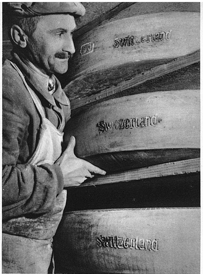
Ready for export

As regards the former, these loaves are manufactured in rural cheese factories which exist in nearly every Emmenthal village and are run by a certified cheese-maker and an assistant, both of whom have usually been trained in the Federal School of Agriculture. These factories are, as a matter of fact, merely small houses, with well-scrubbed tiled floors, spotless deal tables and enormous, polished brass vats. Contrary to what occurs in the Gruyère, the Emmenthal farmers hardly ever make the cheese themselves, but content themselves by selling all their milk to the factories, where the cheese can be produced under the most approved conditions of modern hygienic requirements. As a general rule