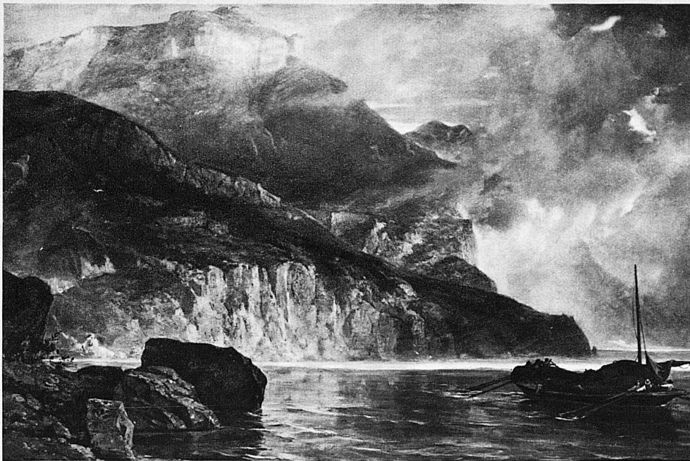
Léon Berthoud: Frohnalp 1865