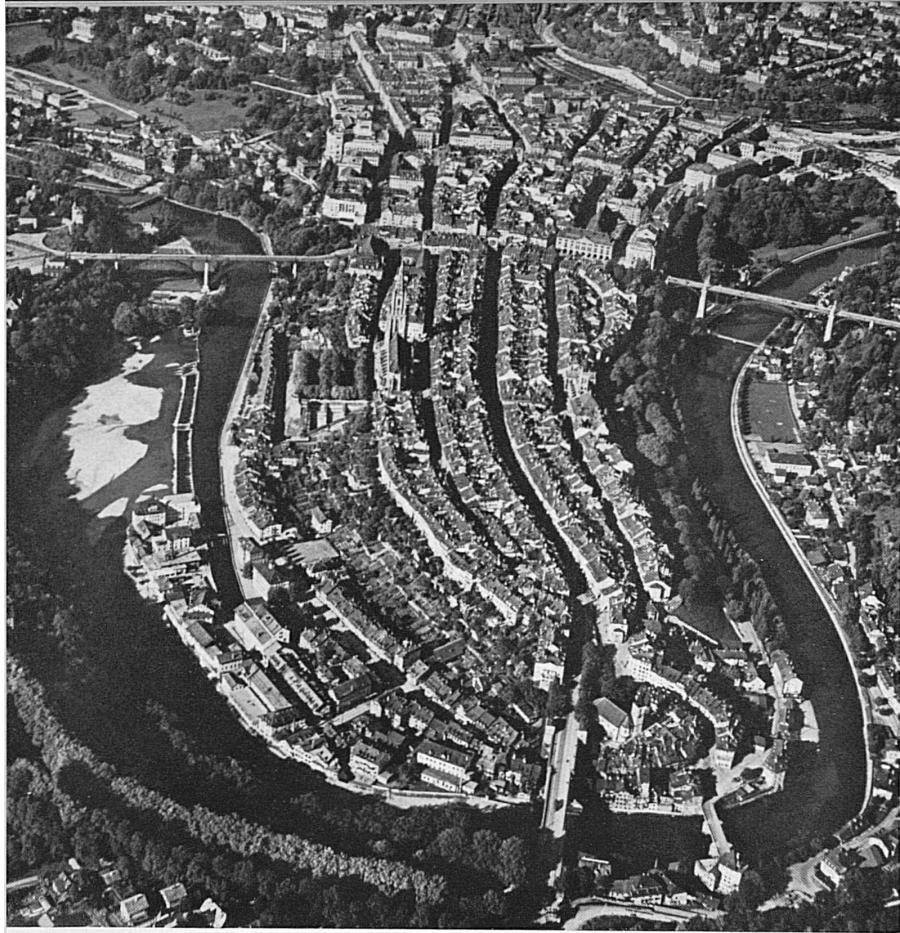
Left: Old Bern from the air. — A gauche: Le vieux Bern à vol d'oiseau — Links: Das alte Bern vom Flugzeug aus Below: The Moses Fountain and Minster Spire — En bas: La fontaine de Moïse et la Tour de la Cathédrale — Unten: Mosesbrunnen und Münsterturm