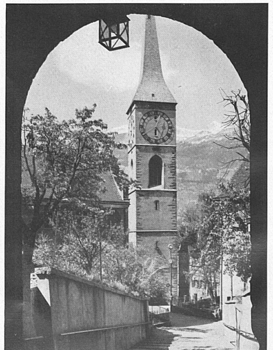
Below: St. Martin Tower in its present form dating from 1917. Unten: Der Turm von St. Martin in seiner 1917 erneuerten Gestalt. — En bas: La tour de l'église St-Martin dans sa forme actuelle datant de 1917. — In basso: L'aspetto attuale della torre di San Martino restaurata nel 1917.

and suddenly, and quite unexpectedly, there appears a diminutive open square in which small public gatherings could be held in comparative privacy and safety—quite an important factor in feudal days! One of these charming haunts goes by the delightful name of “Der süsse Winkel”, the sweet corner, and when the full moon bathes the tiny square in silver one can almost see the burghers of Chur holding their solemn deliberations in the shadow of the episcopal palace, while the Cathedral