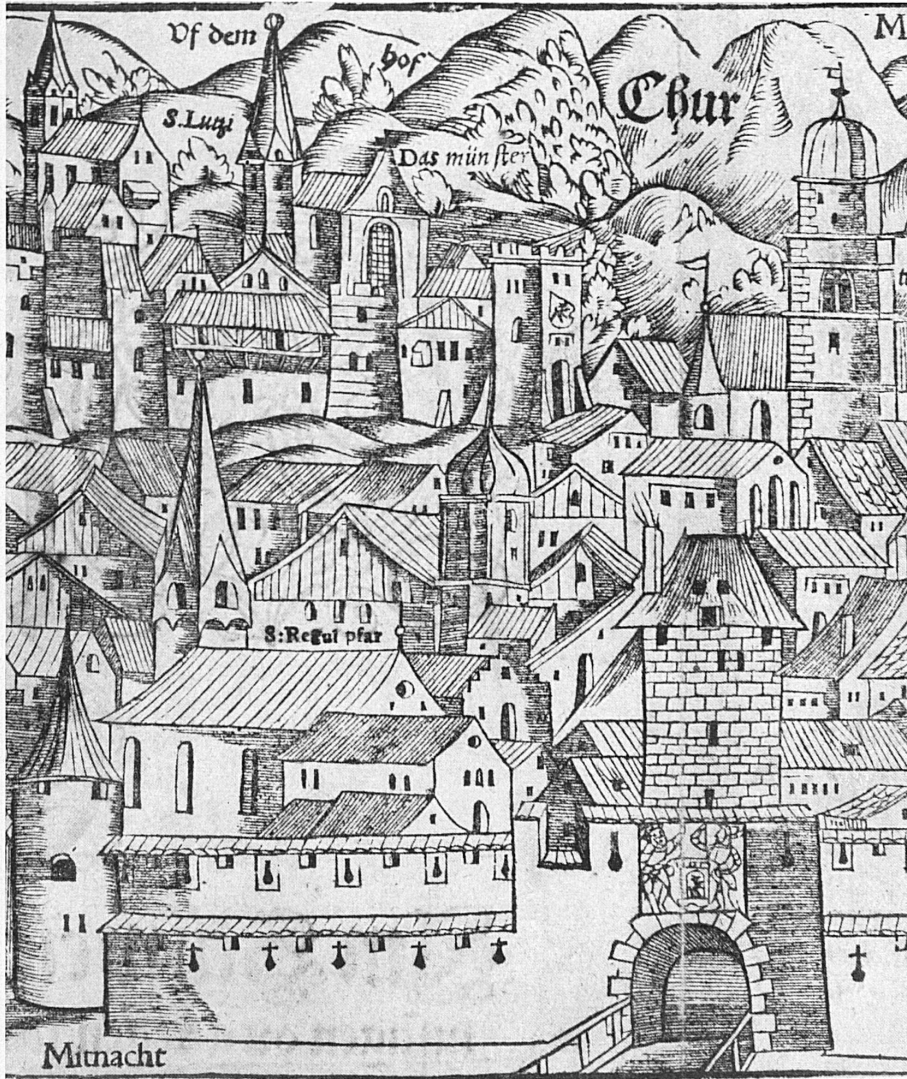
Chur according to Sebastian Münster's Cosmography (1544). Chur nach der Cosmographie von Sebastian Münster (1544). — Coire d'après la cosmographie de Sébastien Munster (1544). — Coira secondo una cosmografia di Sebastiano Münster (1544).

more ancient towers of Marsöl and Spinöl. This mediaeval Cathedral, built during the twelfth and thirteenth centuries, is a perfect specimen of Lombardy architecture and is the finest building of the late Gothic style in Switzerland. The interior is especially beautiful and forms a perfect setting for the really magnificent carving of the High Altar. The Bishops of Chur have exercised a great influence throughout