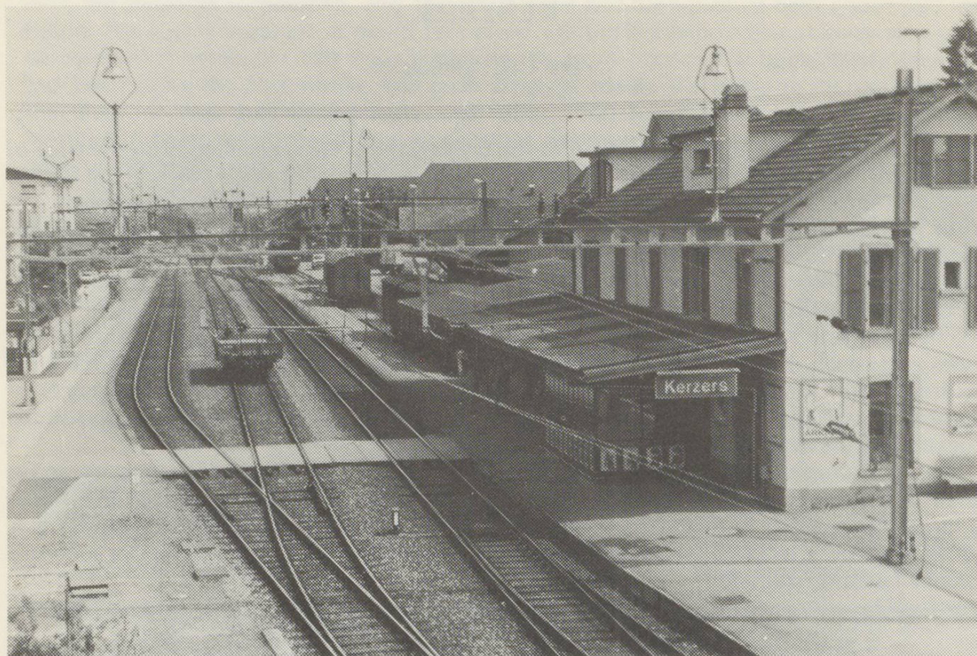
SBB Station looking north toward Lyss.