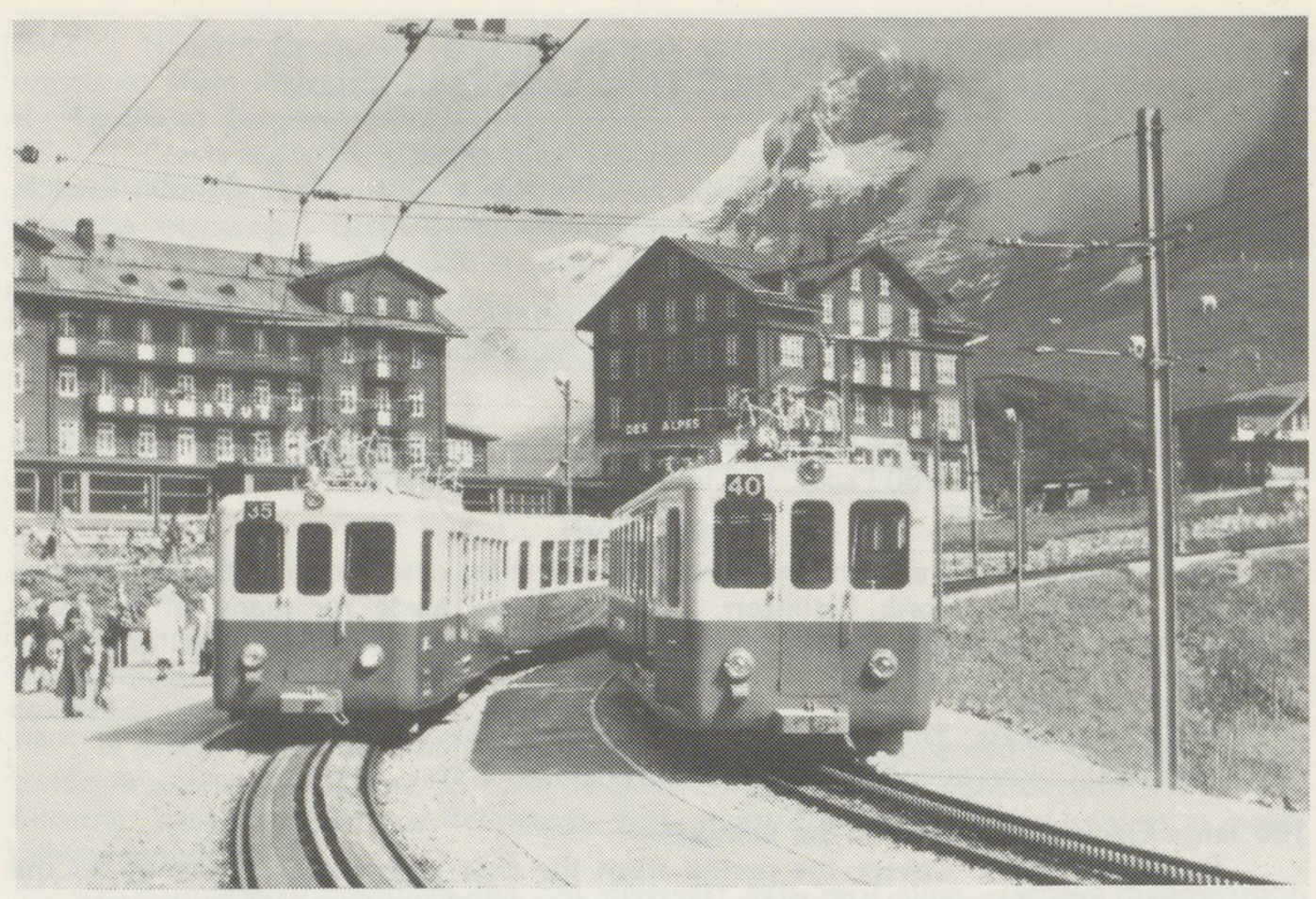
JB. BDhe2/4's at Kleine Scheidegg