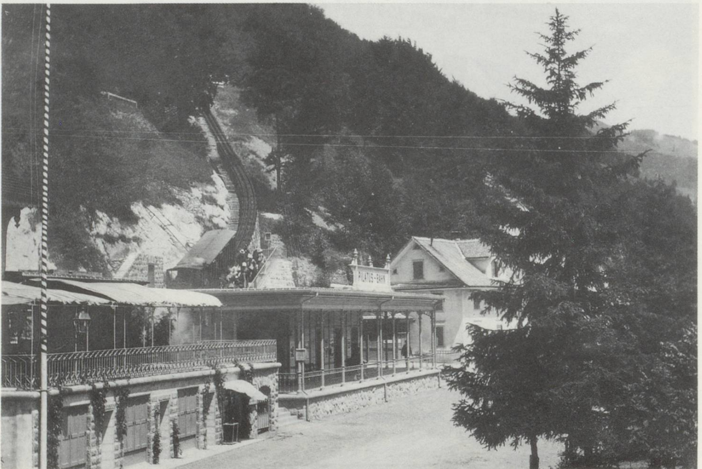
Alpnachstad Station. Early 1900's.

The mountain range had such an attraction that even before the railway was built a number of famous people made the ascent, no mean feat. These included, no less, Queen Victoria in 1868, and the interests of tourism gave rise to the construction, near the peak, of two hotels which opened in 1860.