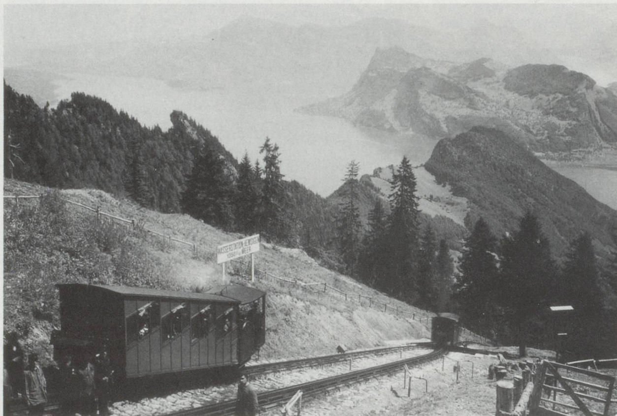
Aemsigen Waterstation and Crossing point.

Marsh in the United States and when he heard of it in 1869 on the opening of the Mount Washington Railway, he visited it. He then constructed a short experimental line in a quarry near Bern to try out his own ideas. These were successful. A suitable candidate for the practical application was soon available in the form of the Vitznau Rigi Railway and, as this system proved itself, the fame of Riggerbach spread with the construction of further lines. However it was not thought to be safe enough for the very steep gradients necessary to produce an economical line up Pilatus. The Mount Washington line had a maximum gradient of just over 33% (1 in 3), but the Swiss Federal Authorities had limited gradients to 25% (1 in 4) for those with vertical pinions meshing in racks as it was feared that there was a real risk of the pinion climbing out of the rack on very steep gradients.