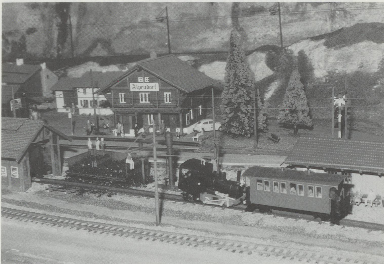
Rack loco and coach await departure from Alpendorf.

The proliferation of tunnels and viaducts on the Rh.B. made it easy to design a 'U' shaped plan which looks reasonably realistic. A curved viaduct (Faller kits) crosses the valley, on the floor of which is a typical mountain stream and road. The wooden station (modified Fides Celerina station kit) serves a village built from local stone (Kibri kits), and the loco shed for the rack railway is a shortened Fides kit of Disentis wooden engine shed. The goods shed and the footbridge over the stream are scratchbuilt from the pieces left over from the Fides kits. Scenery is Pollyfilla and the stream consists of small pieces of slate covered in varnish to give a watery effect.