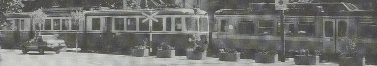
Centovalli ABeB/B and FART SIG built Be4/B at Ponte Brolla, 23.8.88

engineering work between there and Interlaken Ost., which had the rather nice touch that the driver dropped us off in Goldswil, about a hundred yards from our apartment, and saved us the walk uphill from Ost.