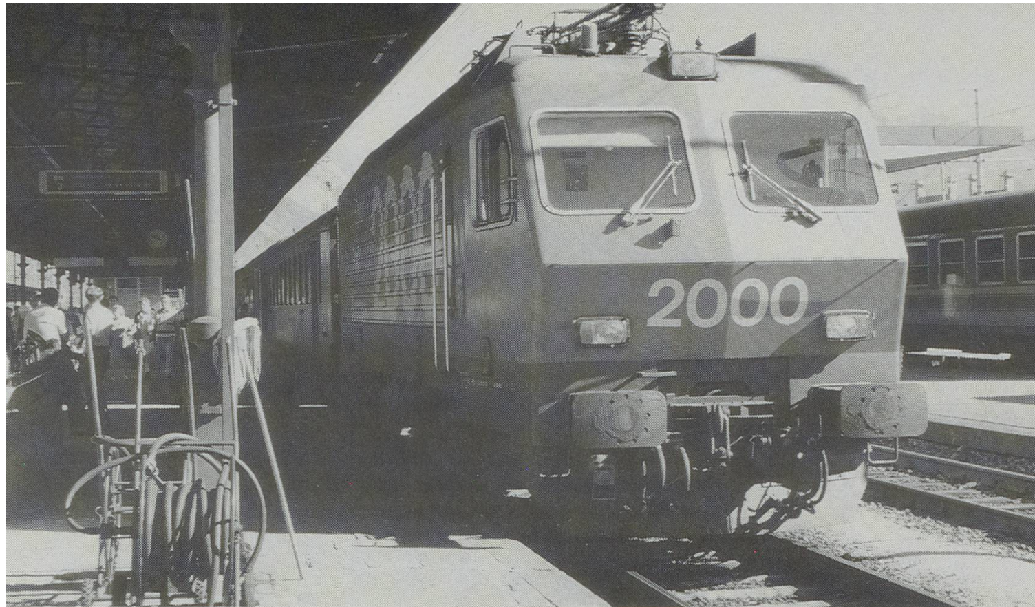
Re4/4 M in Bahn 2000 livery at Dommosodola, at the head of the Geneva - Milan express, with Bern - Ventimiglia portion, 09.55 23.8.88.

through service to Luzern and Basel. We then had a memorable ride, looking out for all the spirals and loops en-route and enjoying the route's very spectacular scenery and engineering. At Bellinzona we passed an express of MkIV stock with a MkIII restaurant car, we also passed a couple of freights, one a Hupack.