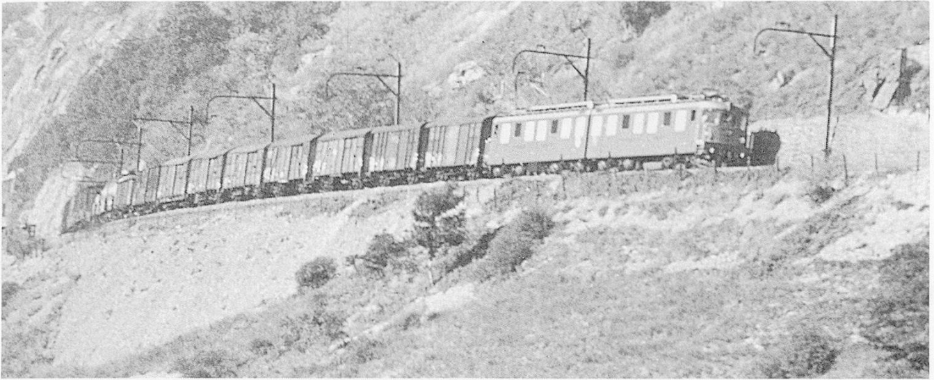
Freights in 1967 were mostly composed of short-wheelbase wagons, as is this example behind a BLS Ae8/8, a short distance from Brig

narrow gauge trains crossing the busy international route could not be tolerated and it was not possible to take the narrow gauge tracks either above or below the main line to reach the Brig yards.