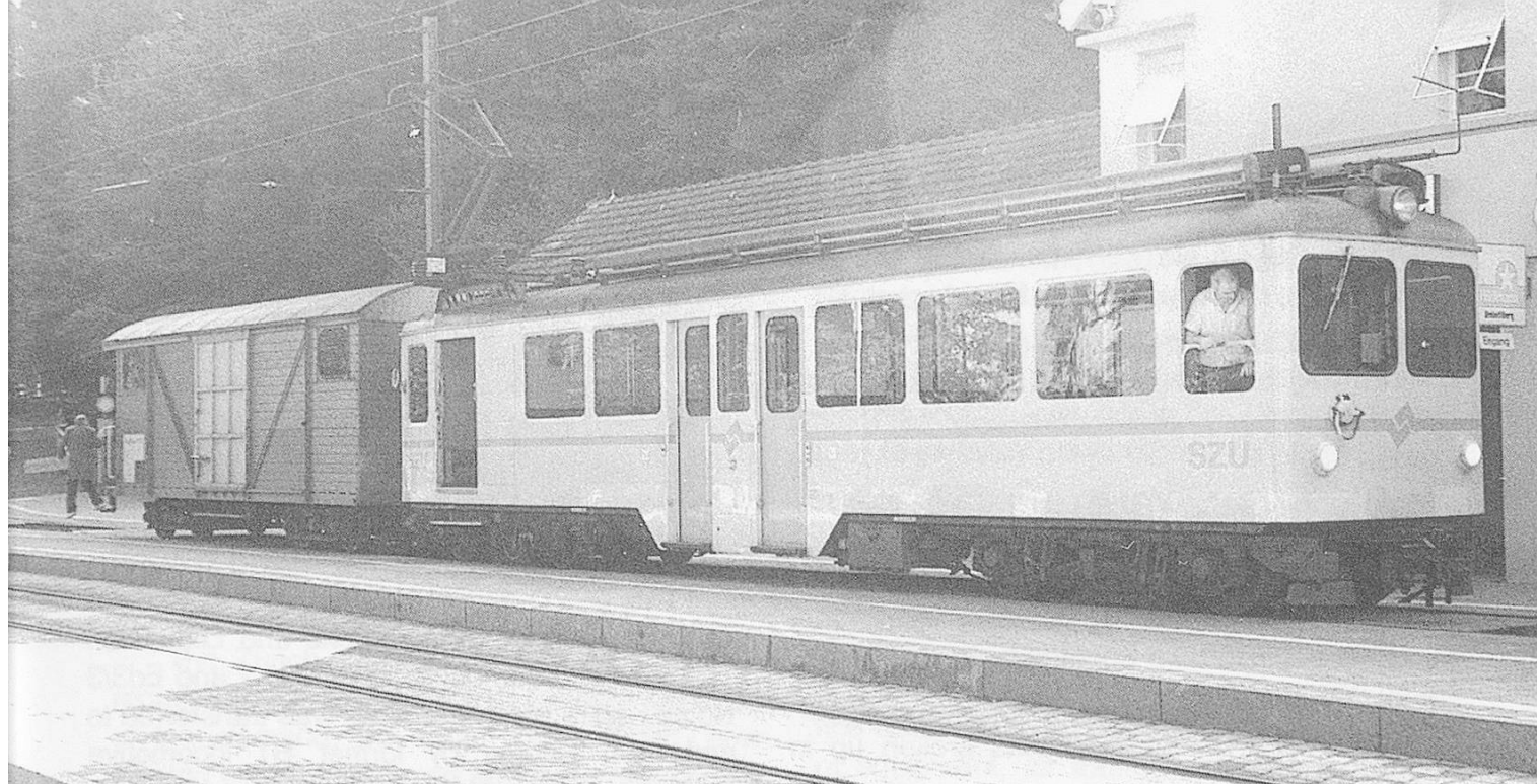
Summit supplies arriving at Uetliberg, 18 June 1993. Older SZU Be4/4 No.11 as "locomotive" for single Haik.