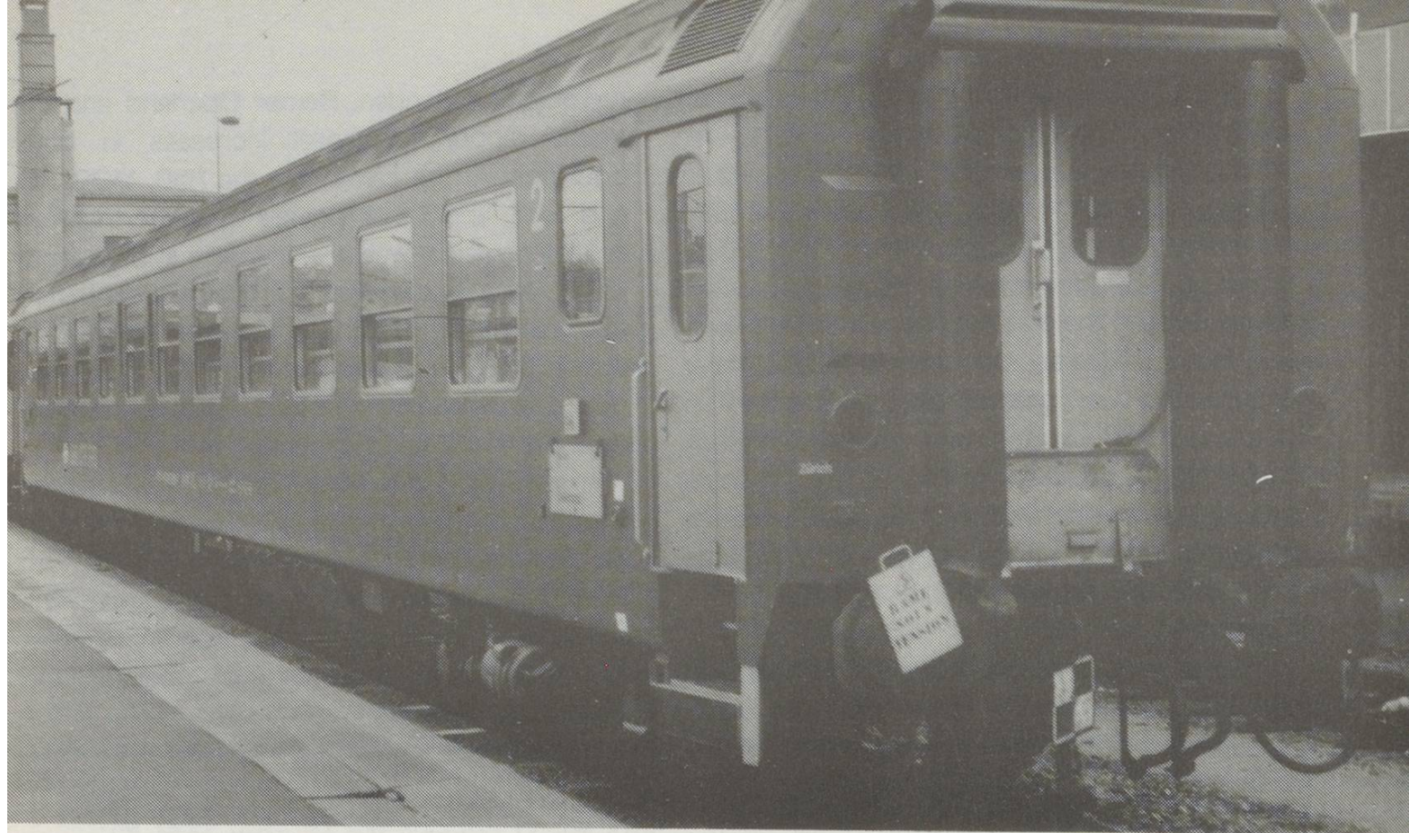
SBB corridor coaches at Belfort, SNCF; 24 March 1992