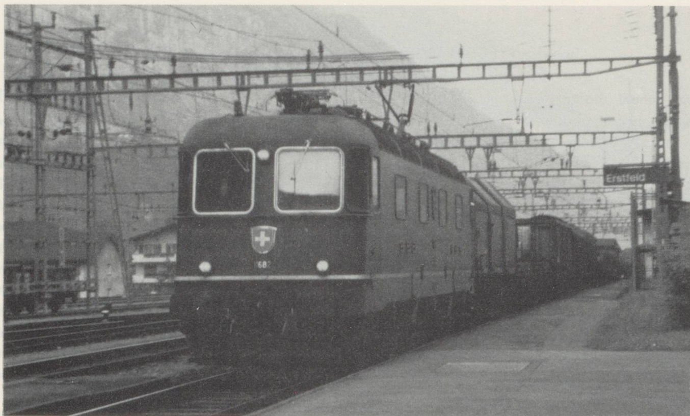
SBB Re6/6 No.11408 at Erstfeld 9 October 1989

busy Gotthard route and almost all passenger trains heading either north or south stop here. There are major expresses that connect Germany and the Low Countries with Italy and, of course, frequent Swiss Intercity trains, as well as regionalzugs and locals.