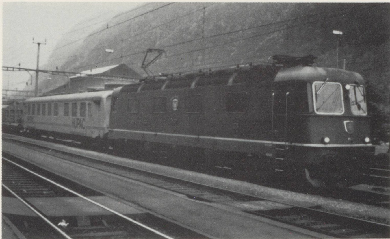
SBB Re6/6 No.11621at Erstfeld 9 October 1989

itself. From the pavements on the bridge over the yards at Hardbrücke one can get a birds eye view of the traffic and the shunting. Many slow moving freights pass beneath the southern end of this bridge towards the Hbf bypass, towards Thalwil, Zug and the Zürich portion of the Gotthard route.