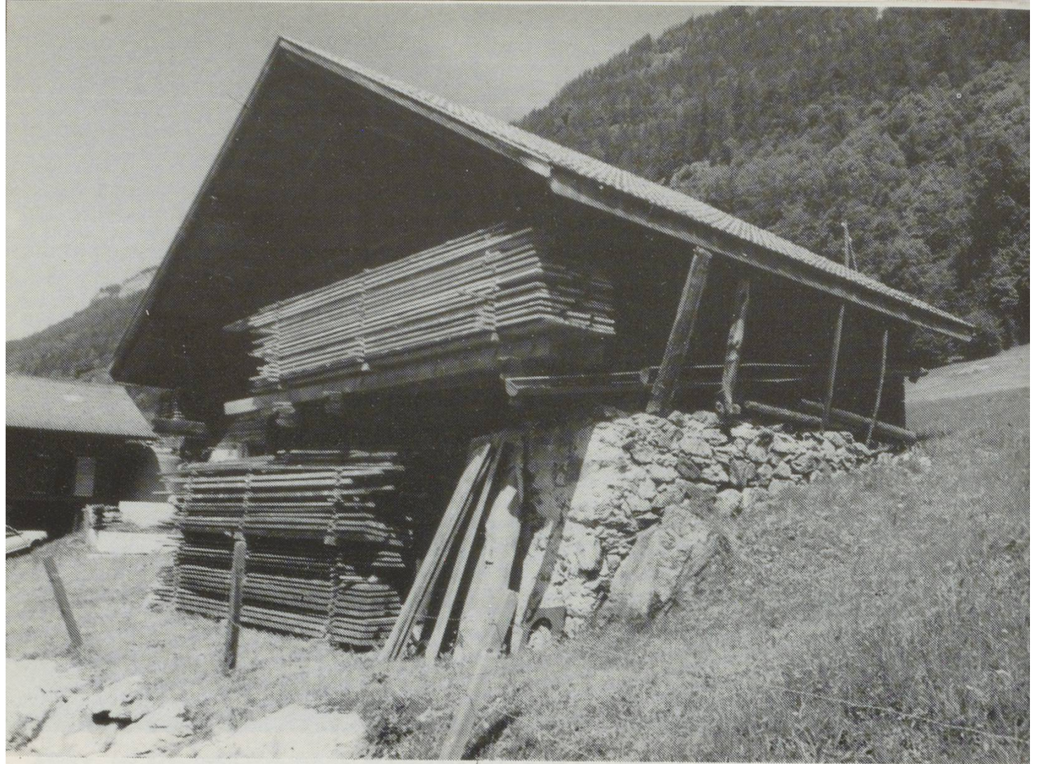
Stored timber under the eaves of a building at Nessental