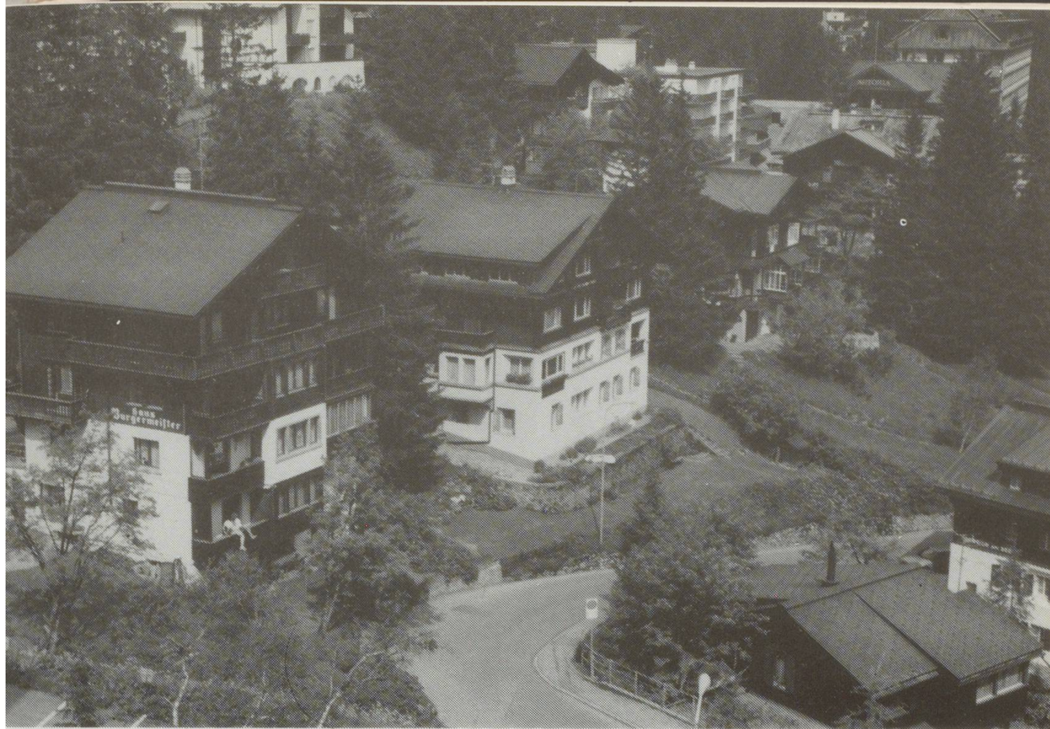
Chalets by the Untersee, Arosa, showing an attractive grouping of houses and road.

addition to the camera, a small pocket notebook. I use a Twinlock 5in x 3in and jot down rough notes and/or make sketches of anything I see that might prove useful at some future date. Once I return home the notes are converted into more readable English, so that when I want to model a particular scene, I look up the notes to see what I've got on the subject. Let me hasten to add that railway notes are also included. The main headings I use are :