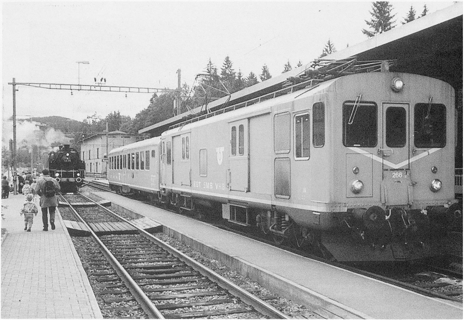
EBT De4/4 266 and Bt, the Wasen shuttle train at Ramsei, 13 June 1993. On the far left, DB 64 518 is gently simmering at the head of the steam special.

return paddler or, if we thought fit, stroll through the town to the station; alternatively we could continue to Flüelen and take the train. We chose the latter, arriving just as it finally decided it was going to rain steadily. Bang went my latest opportunity to record that metallic sculpture commemorating the Rütli salute. The gesture has differing meanings in different countries, none of them complimentary.