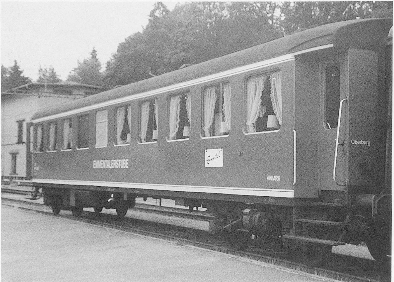
Beautifully restored Eurovapor Emmentalerstube at Ramsei.