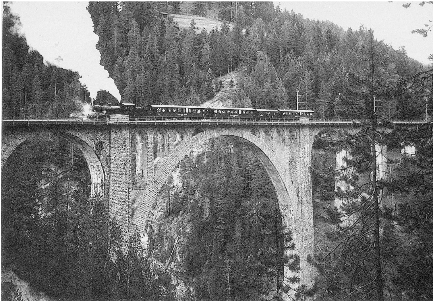
RhB G4/5 No107 on Wiesen Viaduct; Davos - Filisur line, June 1993.

made the track slippery and it had been necessary to travel some distance down the line to get a good grip for the run back. We had a bonus shot of the Davos-Filisur Pendlezug, a splash of bright red against the lush green and grey backdrop. A blast from the whistle and No.107 crawled over the Wiesen viaduct, making plenty of smoke and steam to provide some splendid photos. We scrambled back onto the train and continued on to Filisur.